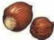
hazelnut (also filbert especially NAmE)